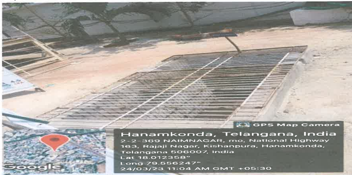
Water Harvesting Pit