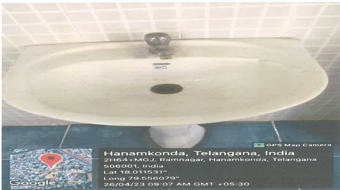
Water Distribution Systems in Wash Rooms