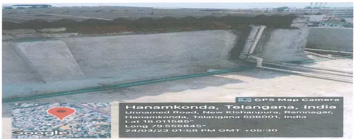
Distribution waste water system to gardening