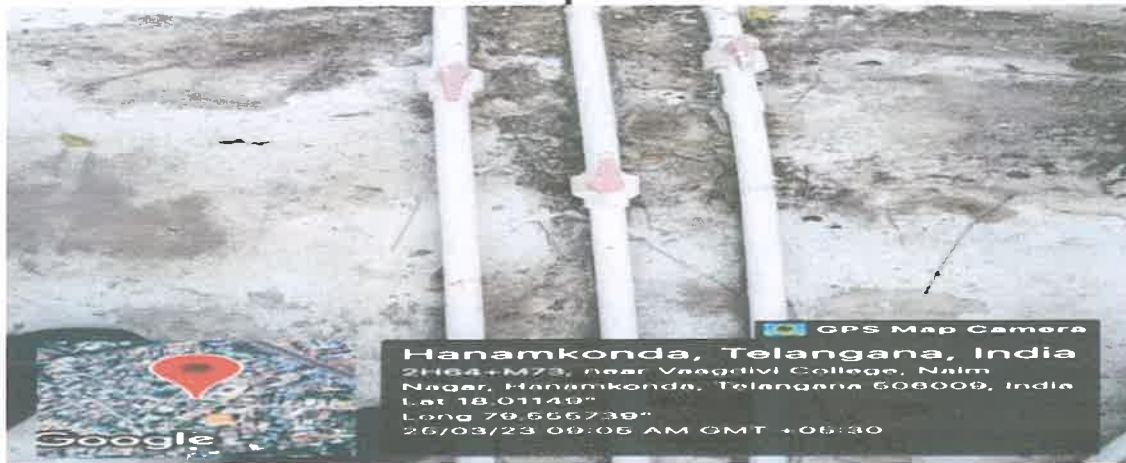
Water Distribution Systems in the College from the Tanks